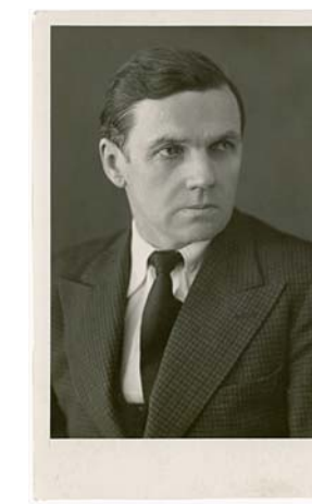
Oto Skulme (1889—1967), the stage-designer and painter, the author of the stage-design for more than 250 theatre performances in the National Theatre, the National Opera and Dailē Theatre; he has painted portraits, still-lives, landscapes, works of historical and daily life genres