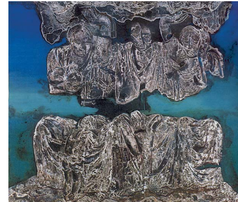
Džemma Skulme. " Kara kariatīdes " [War Caryatids]. 1976. Canvas, oil, property of the Latvian National Museum of Art